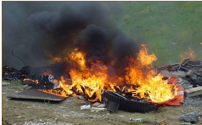
An example of an illegal open burn.

Today's trash is different; plastics, chemicals, and numerous other synthetic materials are far more common in the stuff we throw away. Burning this trash releases high levels of toxic pollutants such as dioxins, sulfur dioxide, lead, and mercury. Children and the elderly are especially sensitive to the air pollution from open burning.